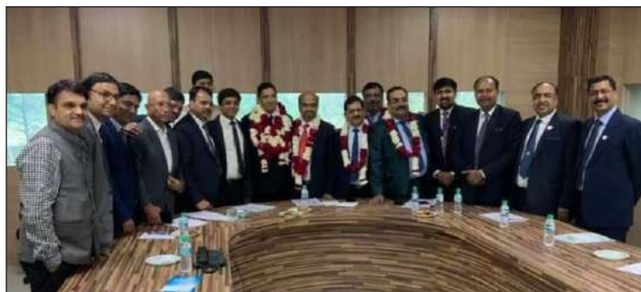
Newly elected office bearer of CIRC