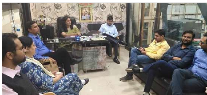
News Letter Committee Meeting