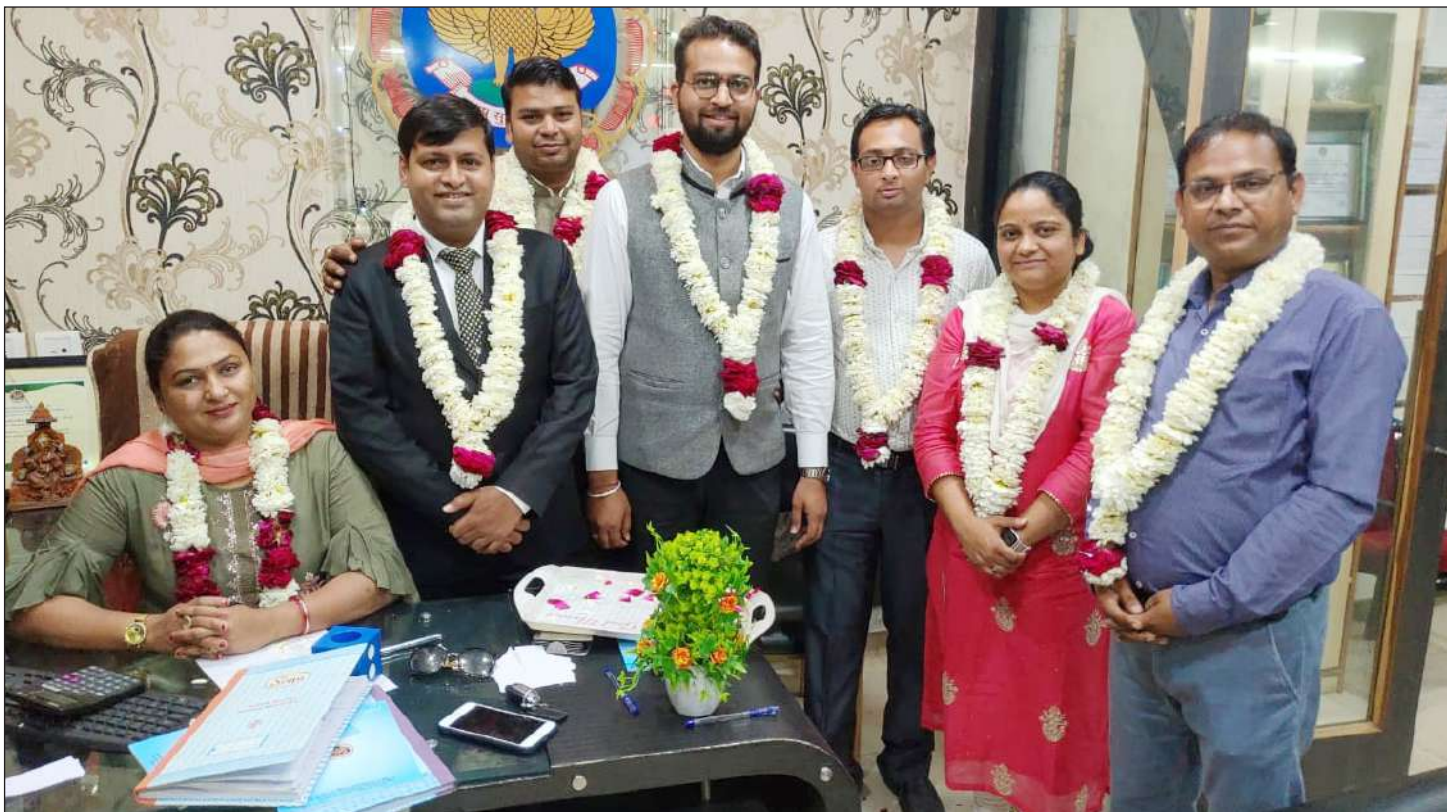
Managing Committee 2020-21