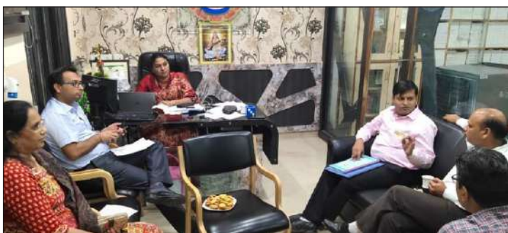
Students' committee meeting